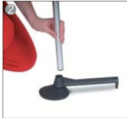
2 Attach pole to base