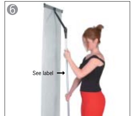
6 Raise top section of pole to apply tension, twist anti-clockwise to lock in place (clockwise to unlock).