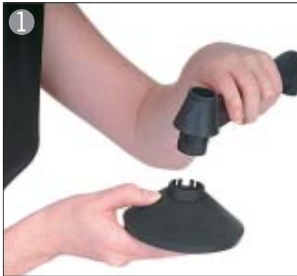
1 Attach bottom rail support to base, opposite the Mark Bric logo