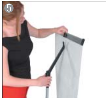
5 Attach top rail