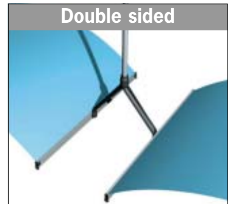
Double sided display uses 2 rail supports on bottom instead of base, as well as 2 rail supports on top.