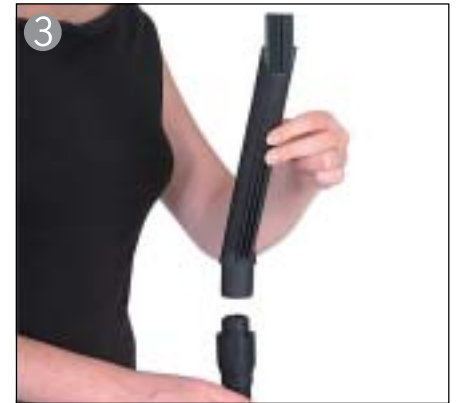
3 Attach top rail support