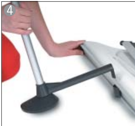
4 Attach bottom rail